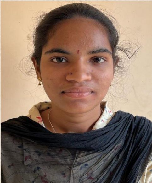
B. MOULIKA II MSCS