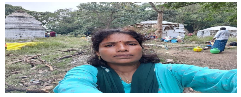
photo left side Siva temple, right side Ammavari temple and Bhairava muni temple.