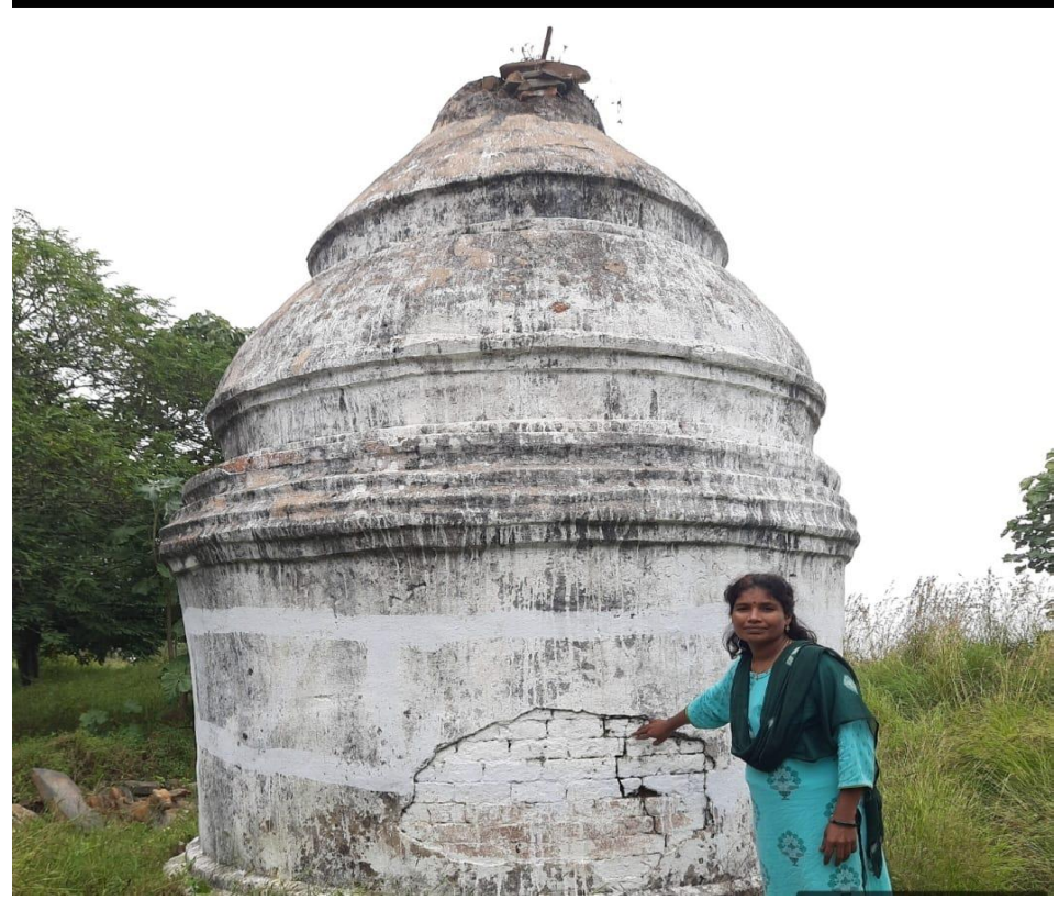
Buddist stupa (now peoples worshipped as Siva temple )