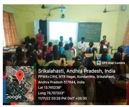
C.Geetha on 11-11-22